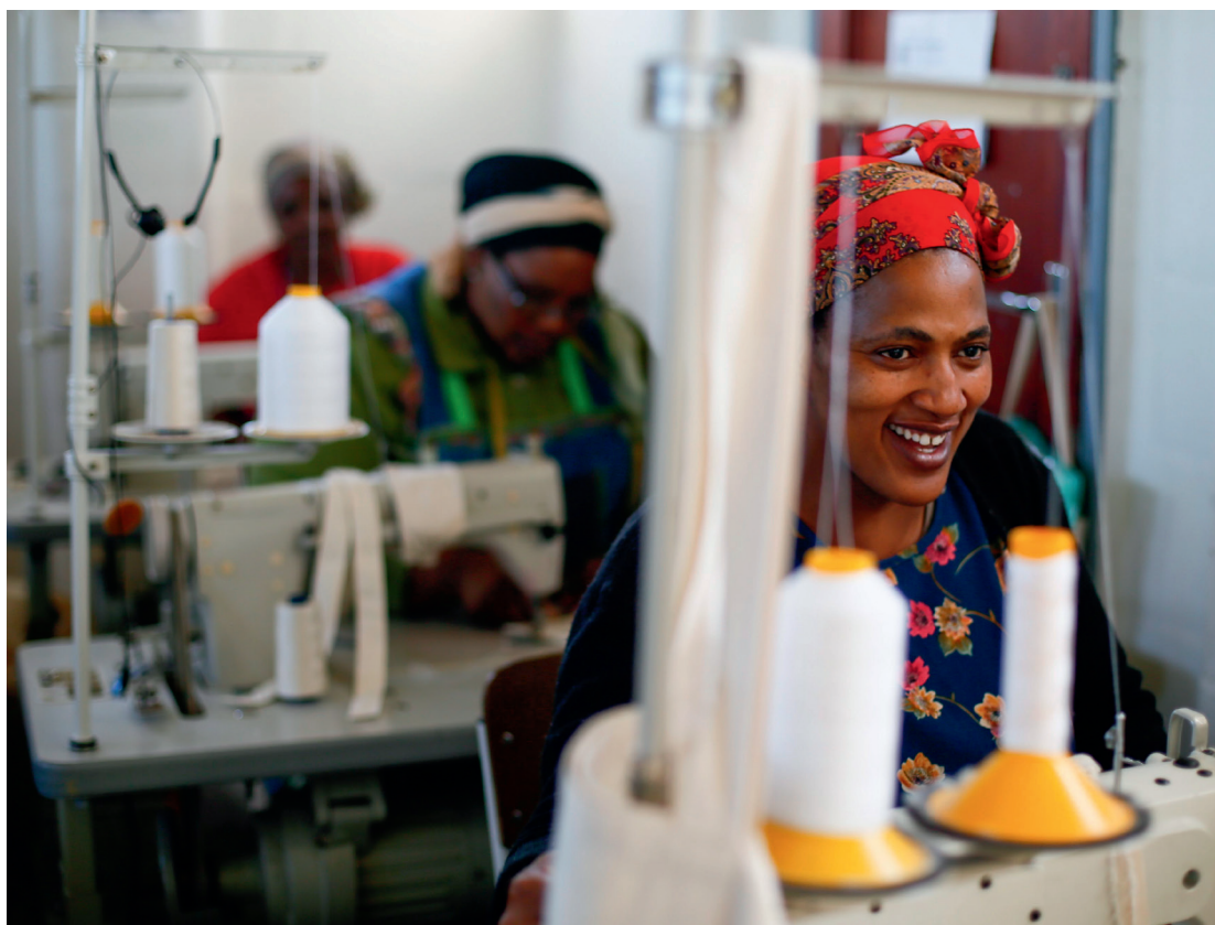
Seamstress who works in the cooperative « Singalaka » that offers sustainable economic opportunities for men and women in South African townships.