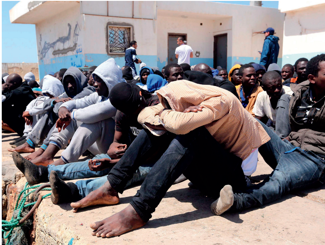
Irregular migrants at the harbour of Tripoli, Libya, after 117 migrants with African origin have been rescued by two coastal boats off Libya's coast.

The effort to stabilise fragile countries and situations and create a favourable, sustainable economic and political development is closely related with managing future migration flows. Especially Goal No. 1 (poverty), Goal No. 8 (growth and employment) and Goal No. 16 (peace, justice and institutions) are central to managing migration together with states' responsibility to readmit their own citizens, which is included in Agenda 2030.