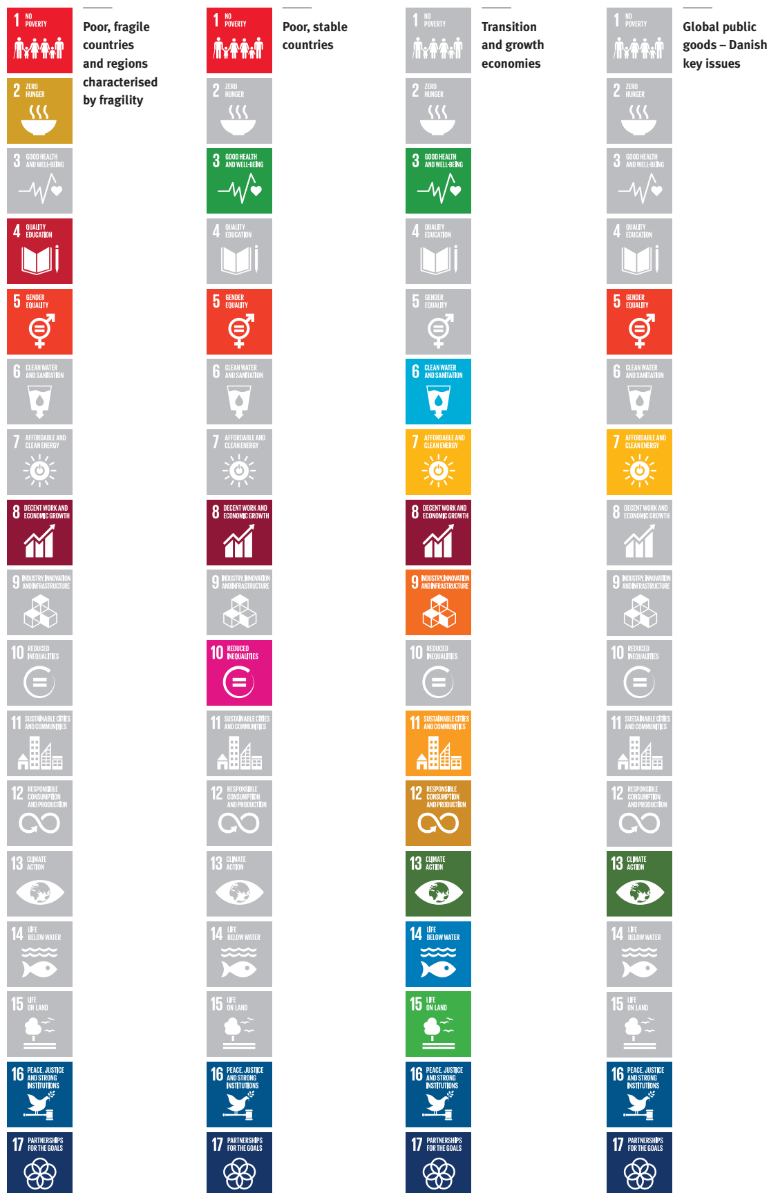
2.6 Figure 1 – prioritised Sustainable Development Goals, by country category and global public goods