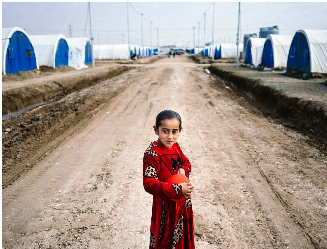
Iraqi girl who has fled Islamic State and who is currently living in Khazer refugee camp.

Peace and security and the challenges faced by countries affected by conflict and fragility take a central position in the Sustainable Development Goals. This is first and foremost the case for Goal No. 16 (peace, justice and institutions), which will have a central position in the Danish engagement. In addition, we prioritise Goal No. 1 (poverty), Goal No. 2 (hunger) and Goal No. 8 (employment) in and around fragile states and situations. We also promote other goals, i.a. in the social area Goal No. 4 (education) and Goal No. 5 (gender equality) through our multilateral initiatives and the civil society cooperation.