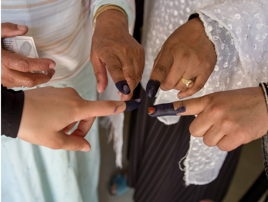
Afghan women who have just voted in the second round of the Presidential election in Afghanistan in 2014.

Denmark will be a significant global defender of human rights, democracy and gender equality. We will promote these values in a wide range of connections, from our contract with private businesses to active participation in UN negotiations in this regard. Human rights, democracy, good governance, the rule of law and gender equality represent a separate priority area of the Danish development cooperation. It is a condition for fulfilling the Sustainable Development Goals and an integral part hereof, particularly Goal No. 5 (gender equality) and Goal No. 16 (peace, justice and institutions), but also Goal No. 1 (poverty) which includes land and property rights. Denmark will support democracies in their right to be democracies, including their right to participate as equal partners in multilateral organisations – an important initiative in this regard is the Neighbourhood Programme for Eastern Europe, which focuses on fragile democracies in Ukraine and Georgia.