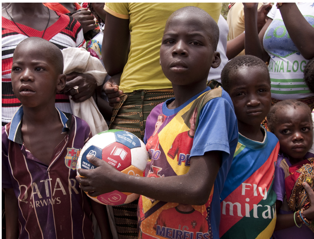
Boy with a Danish designed soccer ball showing the Sustainable Development Goals in Kamsé Village in the Kaya region, Burkina Faso.